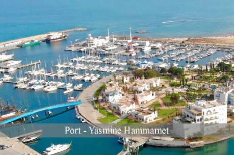
Port - Yasmine Hammamet