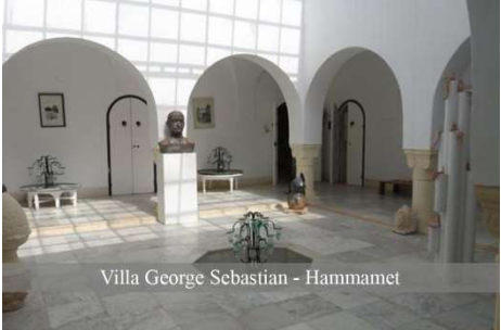
Villa George Sebastian - Hammamet