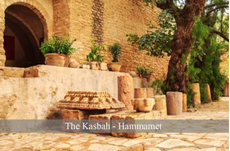
The Kasbah - Hammamet