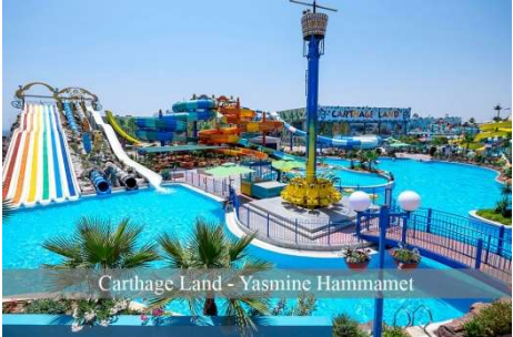
Carthage Land - Yasmine Hammamet