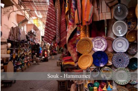
Souk - Hammamet